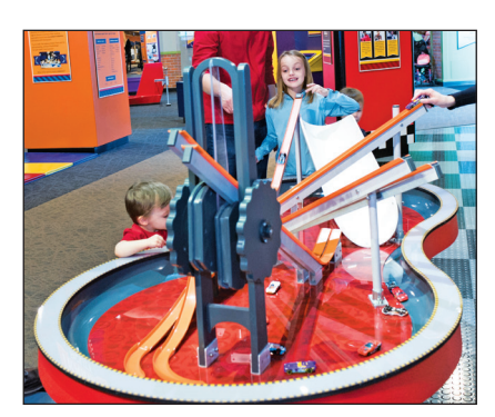
Young Toddler Rev up your engines and "race" cars around the play table track.