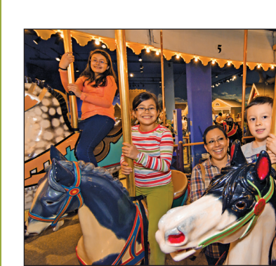
Family Fun Carousel Ride

Navigate your way through the mirror maze, taking twists and turns that lead you to new discoveries.