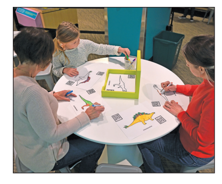
Family Fun Dinosaurs Alive!

*Visit childrensmuseum.org/visit/ calendar for daily program times.